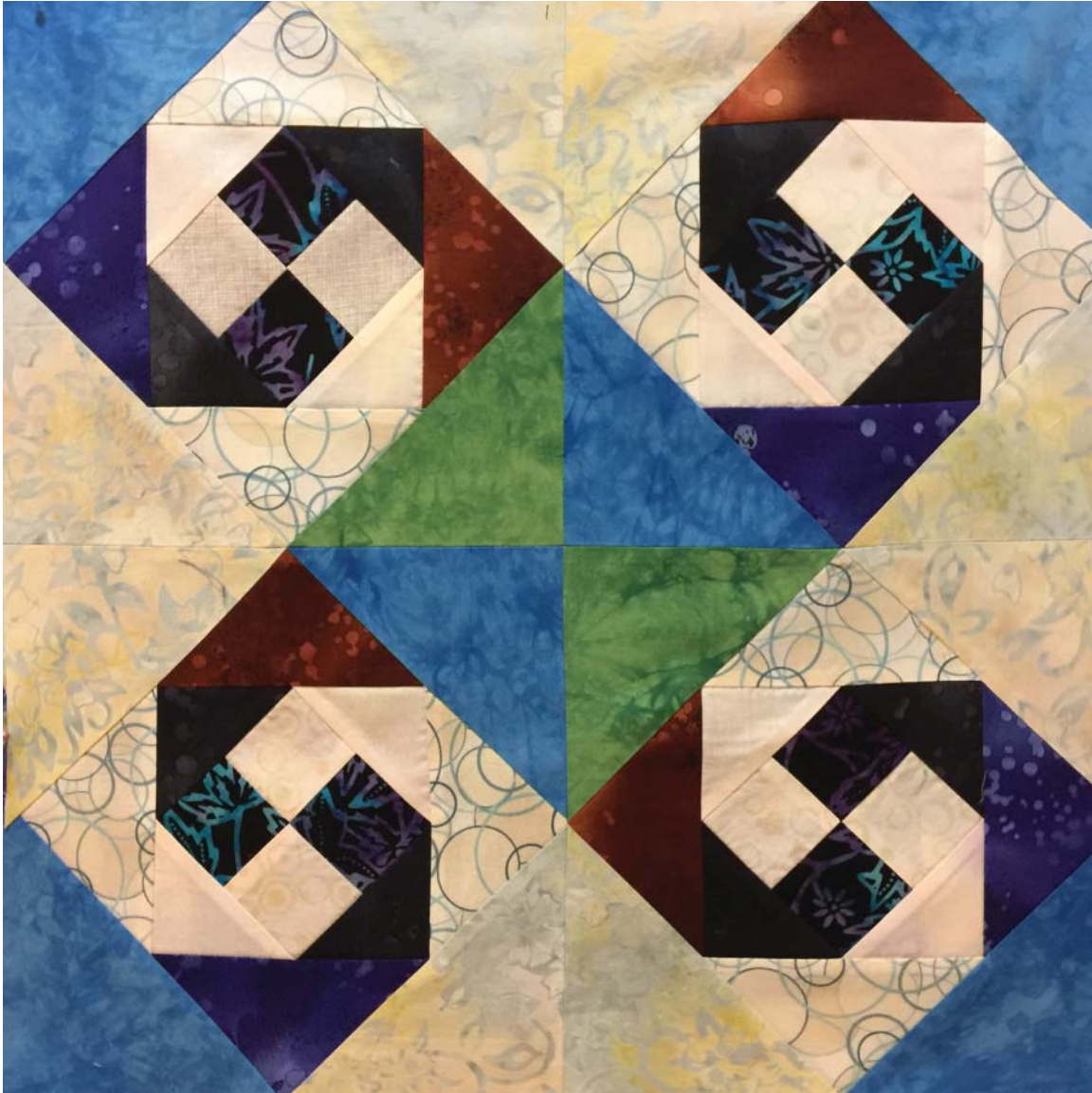
Scrappy Snail's Trail Four Blocks Combined