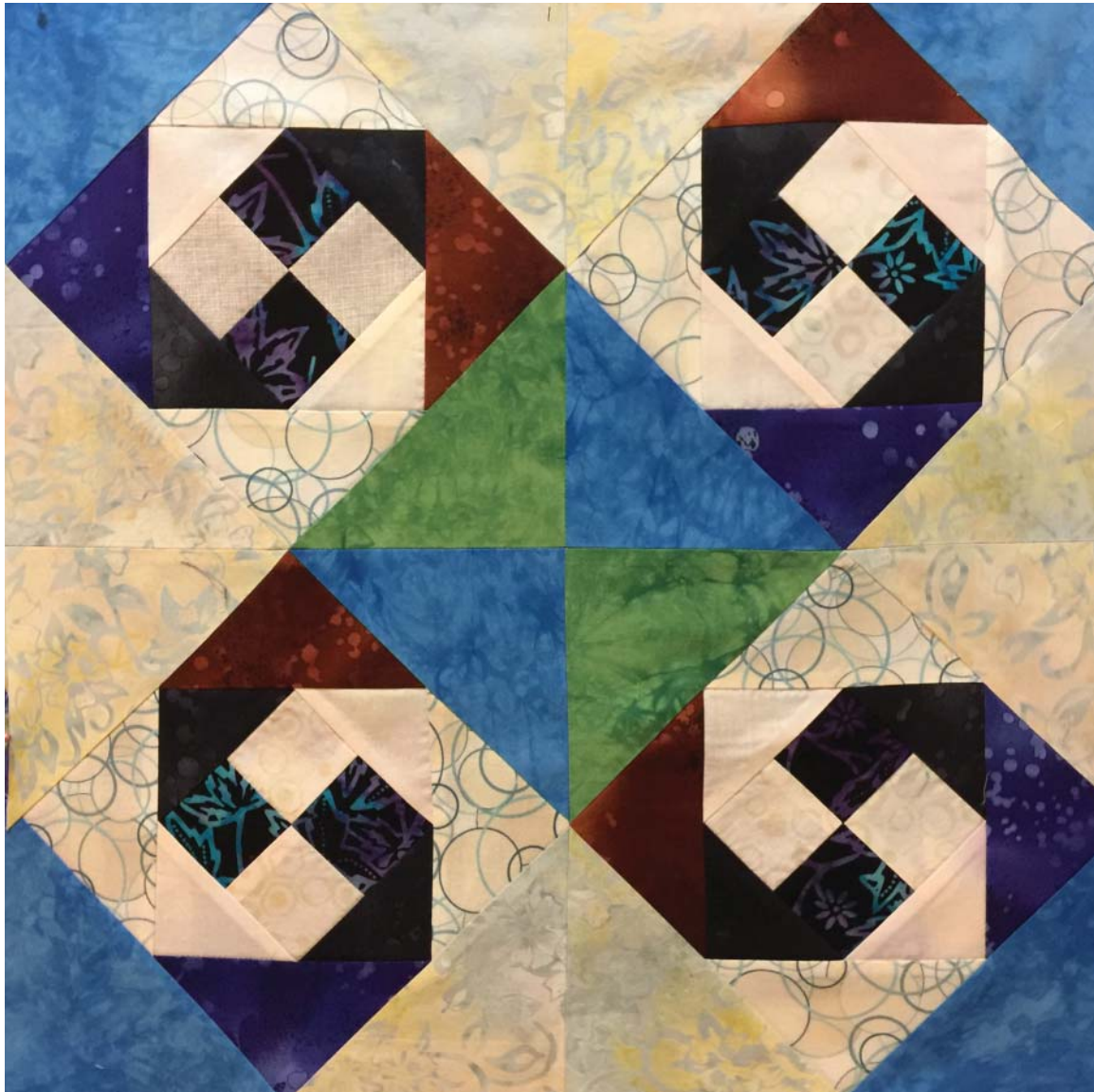
Scrappy Snail's Trail Four Blocks Combined