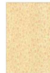
4 x 6 inches finished Make 8