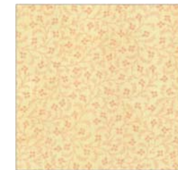
6 x 6 inches finished Make 6—cut larger for appliqué, trim to size