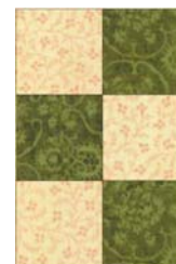
4 x 6 inches finished Make 12