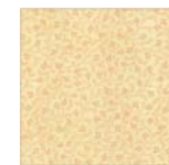
4 x 4 inches finished Make 4